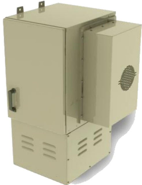
RAC24 with side-mount direct air cooler and battery pedestal