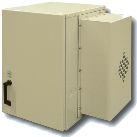
RAC24 with side-mount thermoelectric cooler

Preset configurations, adjustable components, and a wide variety of kits and accessories provide exactly what you need to deploy your equipment in any environment or location.